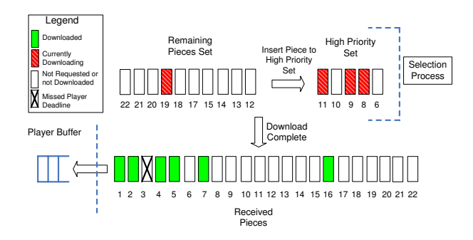
Fig. 1. Our Approach for Supporting Streaming in BT

since the Free-Rider can wait more time until the whole file is downloaded. However, with time sensitive traffic, the Free-Riders cannot afford to wait more time, since each piece has a certain lifetime. In other words, time constrained data distribution provides stronger incentives to peers to avoid being Free-Riders.